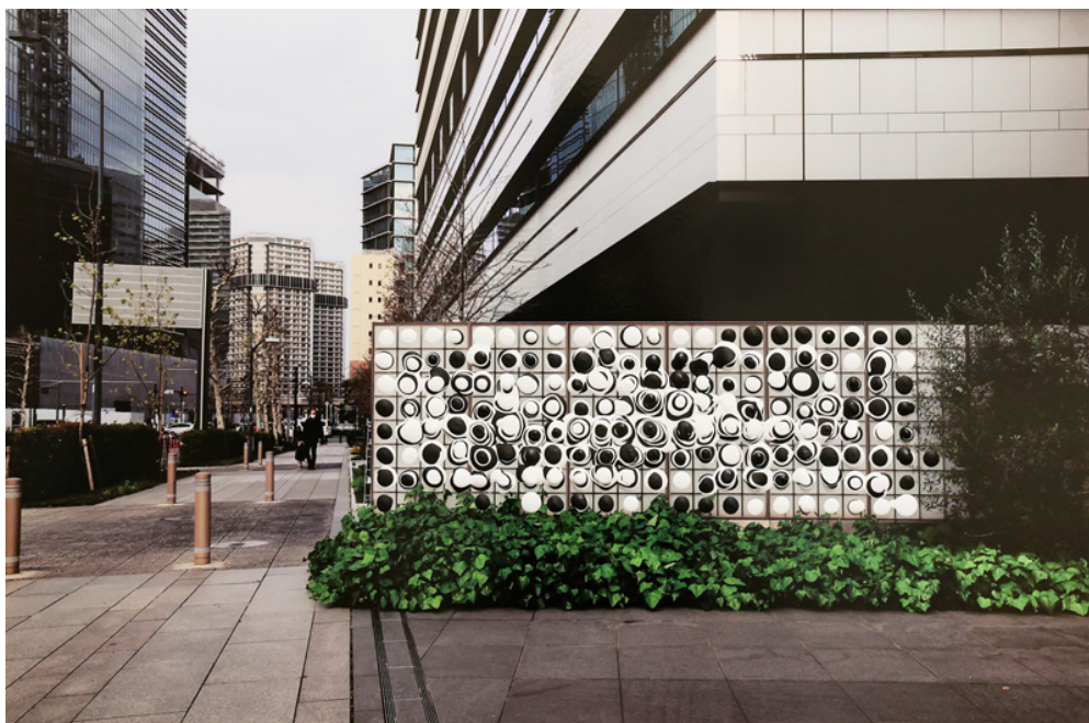
Landscape in a Grid - 4, Minatomirai, Nishi-ku, Yokohama photograph, acrylic glass, acrylic paint 45x67.5x1.5cm 2023