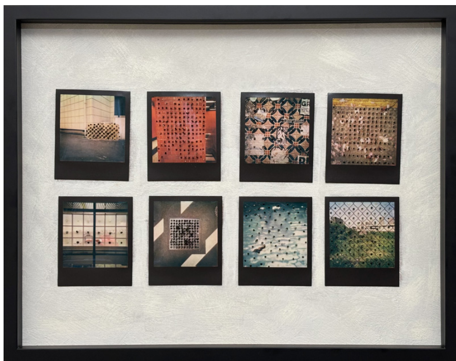
Landscape in a Grid - Hong Kong, Tokyo, Yokohama Polaroid film, acrylic paint, board 42x53x3.2cm 2025