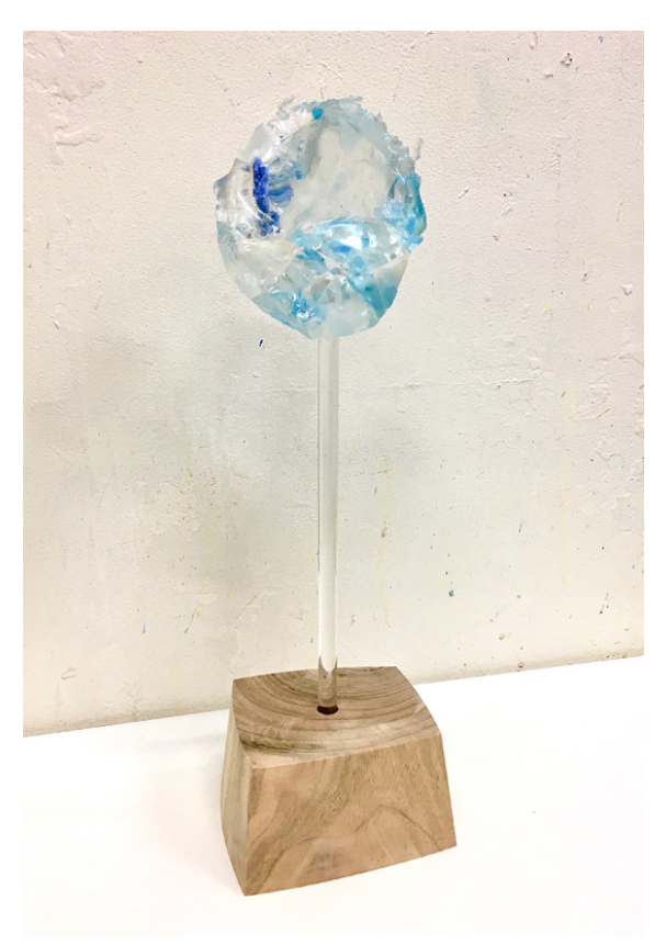
B-M-Light-2022 glass, wood 12.5x11x39cm 2022