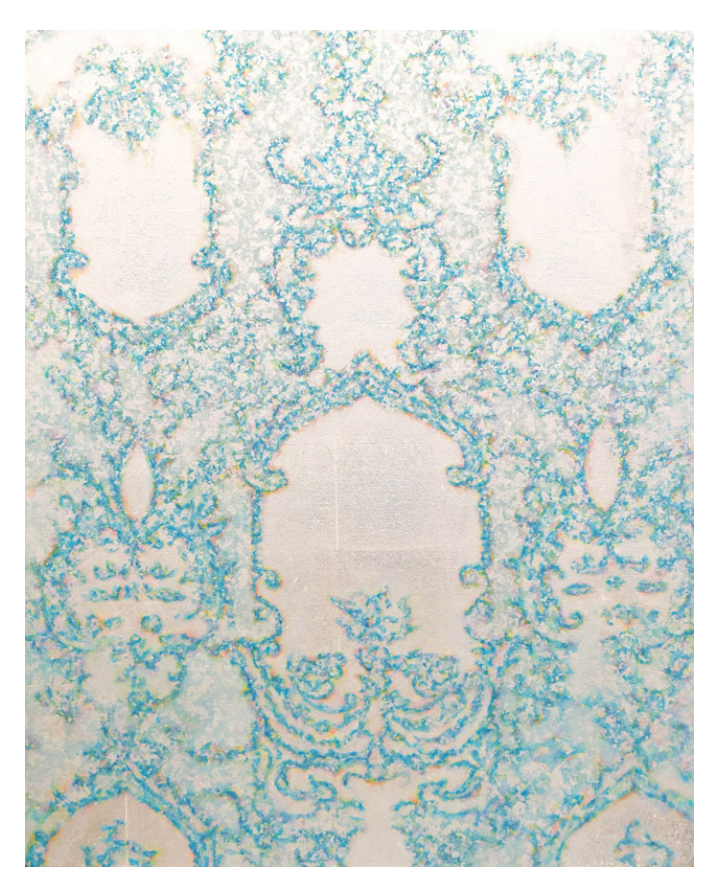
V-C-Light-2022 aluminum leaf, tempera, oil on chalk grounded canvas 100x80.3cm 2022