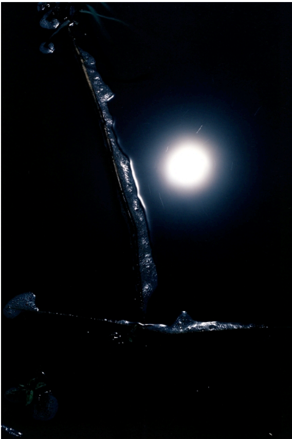
"suns" C-print 50x34cm