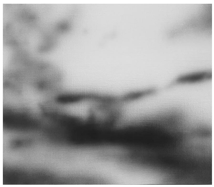
Out of Frame Chinese ink on linen 45x53cm 2023