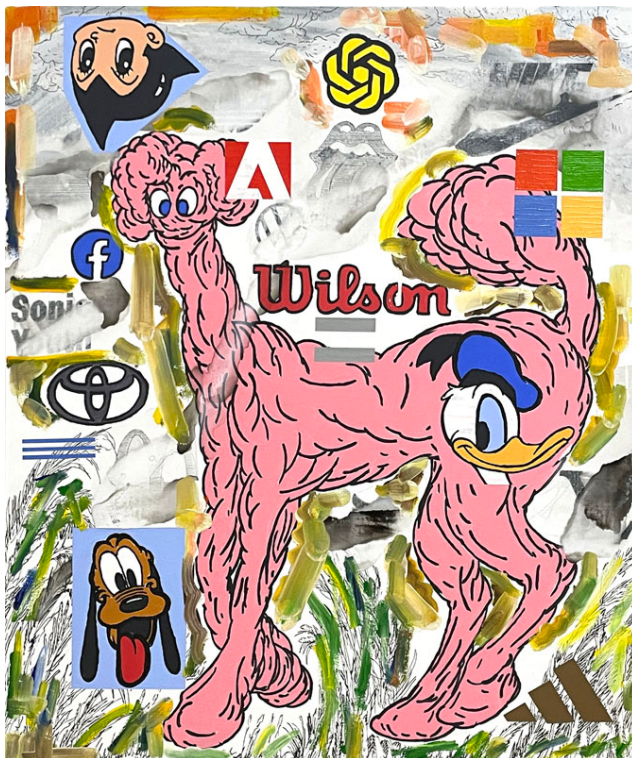
AI Sun and PINK BRAIN

oil, acrylic, marker pen, gesso on cotton 61x46.5cm 2023