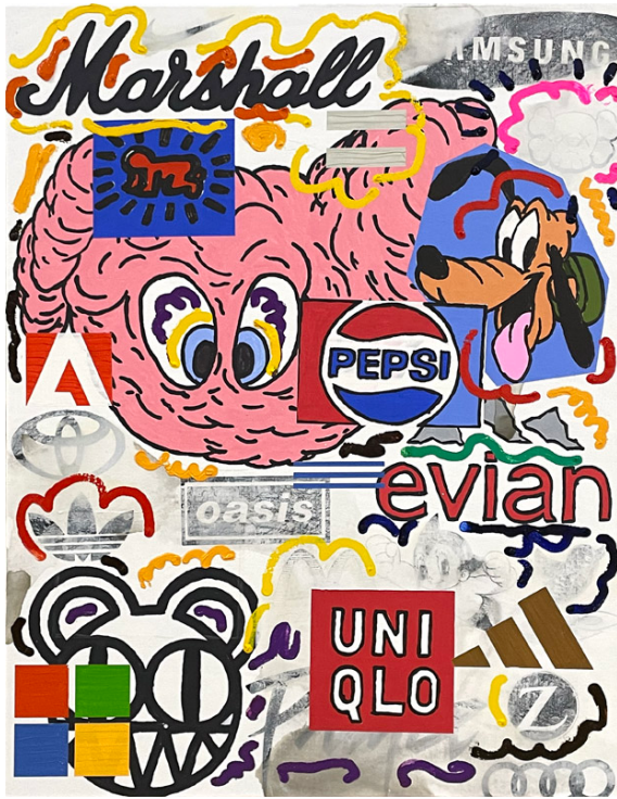
PINK BRAIN □

oil, acrylic, marker pen, gesso on cotton 61x46.5cm 2023