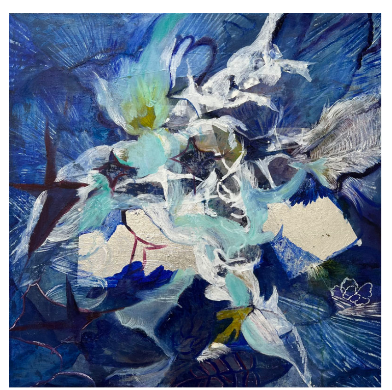
Natsumi Nanashino good blue (nightjar star) oil, tempera, aluminum leaf on canvas 72.7x72.7cm 2024