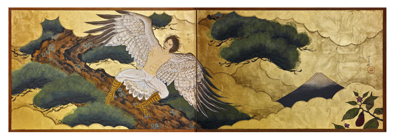
Ryoko Kimura Happy Dream of the Year pigment, gold leaf on paper (two-panel folding screen) 60.5x180cm 2016