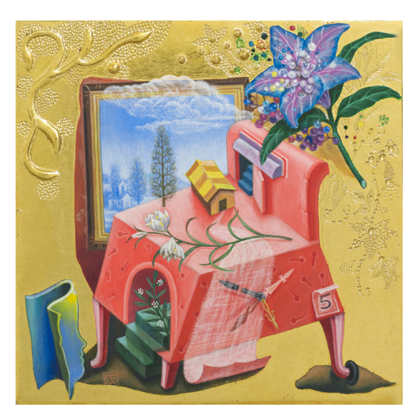
Jungduk Song Space for Reminiscence tempera, gold leaf on wood 12.5x12.5cm 2022