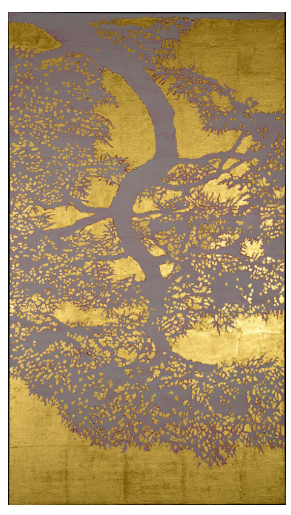
Masako Yasuki Pine Tree (Silent Reflections) gold leaf, pigment on wooden panel, hemp cloth, Gesso Bologna 90x50cm 2022