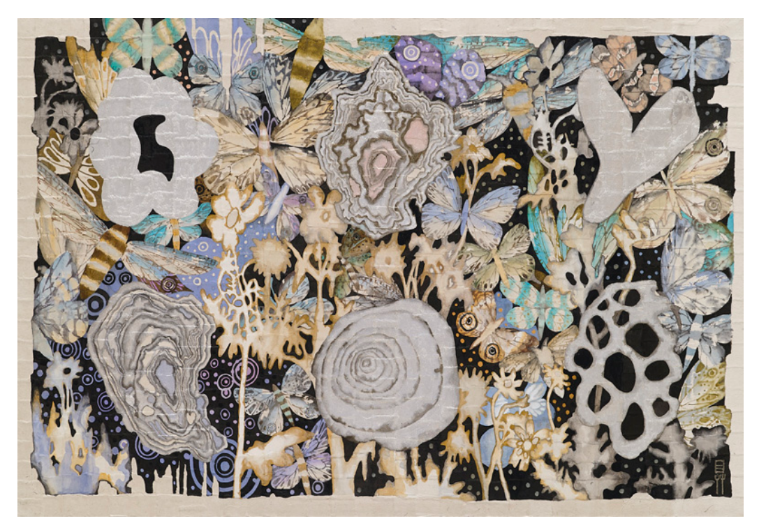
Bona Koo Co-evolution 2 ink, pigment, gold powder, silver powder on Korean paper (collage) 96.5x66cm 2022