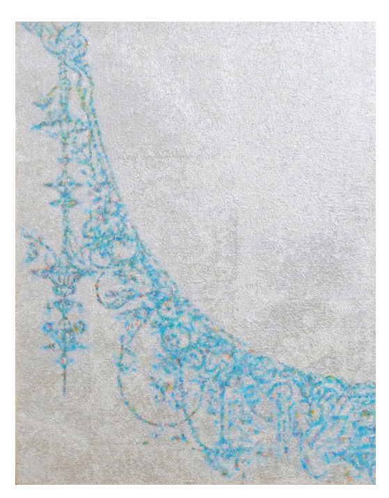
Noriyori Shirakawa V-C-Light- 2022 aluminum leaf, tempera, oil on chalk grounded canvas 40.9x31.8cm 2022