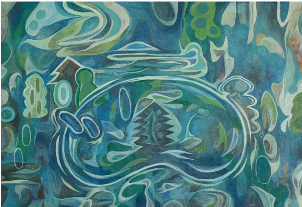
Sea Slug Traversing the Forest II